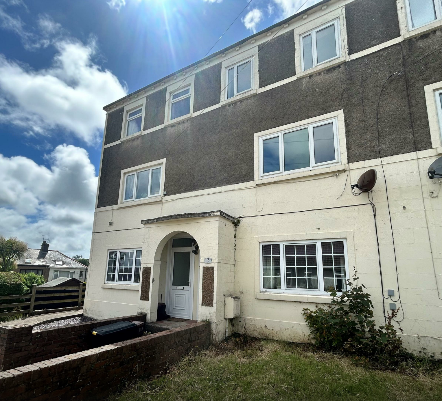
Flat 3, Margam House Bridgend, CF31 4BB